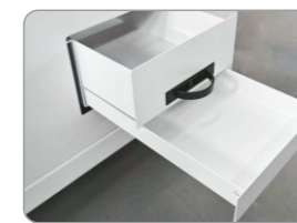
Interactive powder cabin