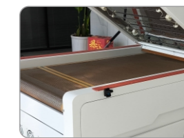
Heating area up to 1150mm