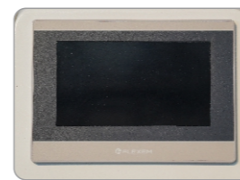
Multi-language touch screen