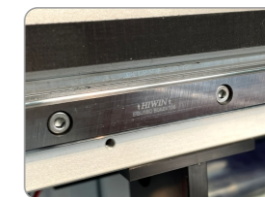
HIWIN guide rail